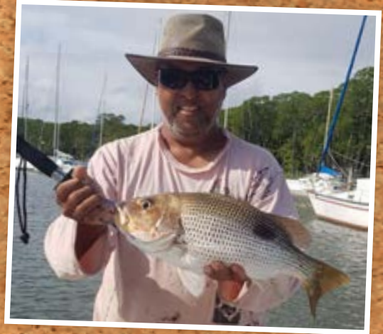
Fishing Port Douglas Charters caught a variety of estuary species including Fingermark