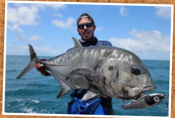
Saltaire Charters again proved they are the GT specialists in the region